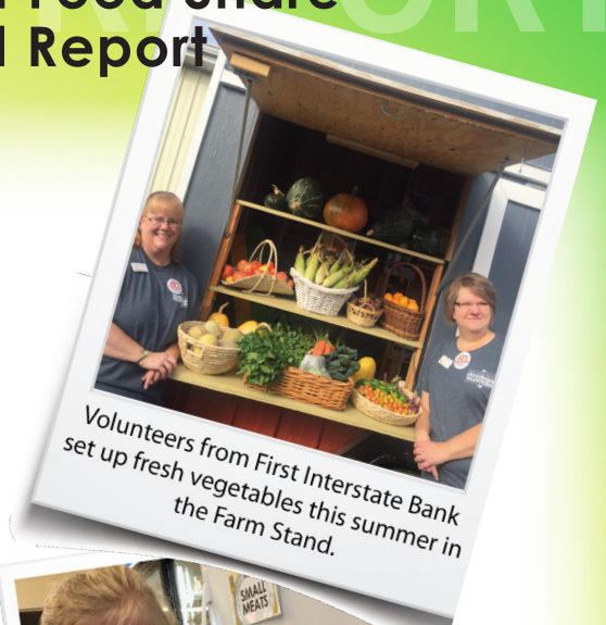
Volunteers from First Interstate Bank set up fresh vegetables this summer in the Farm Stand.