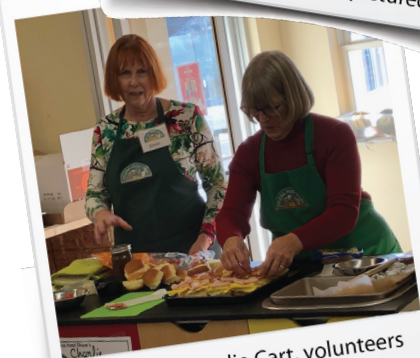
Using the Charlie Cart, volunteers teach healthy cooking classes to customers at Helena Food Share.