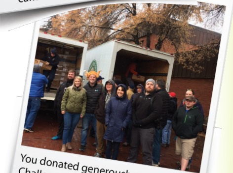
You donated generously to the Turkey Challenge & 2,285 holiday meals were distributed. SoFi crew pictured here.