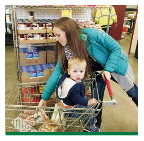
A local mom shops for nutritious food with her son at Helena Food Share's Lewis Street Pantry.

* FeedingAmerica.org/research/ hunger-in-working-america