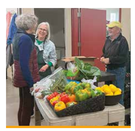
Volunteers stocking the Pantry with food for the day.

Providing food to those in need is often viewed as a handout, bringing to mind an image of someone with plenty handing something essential to someone in need. Helena Food Share endeavors to change that