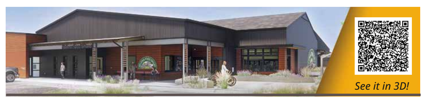
Gifts designated "Building Campaign" will help build the new Community Food Resource Center.