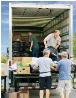
Senior Commodities distribution

Customers utilizing the Senior Commodities program decreased slightly throughout the year as seniors limited their activities due to the pandemic. We have seen customers return this fall and continue to promote the program to eligible audiences.