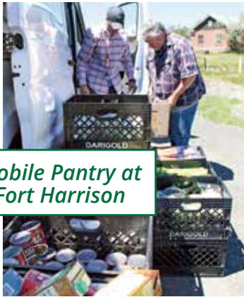
Mobile Pantry at Fort Harrison

Mobile Pantry services grew as the year progressed. A new program at Fort Harrison for veterans as part of Montana Joining Community Forces started in May. The Mobile Pantry also serves low-income Helena residents with mobility restrictions