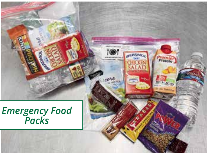
Emergency Food Packs