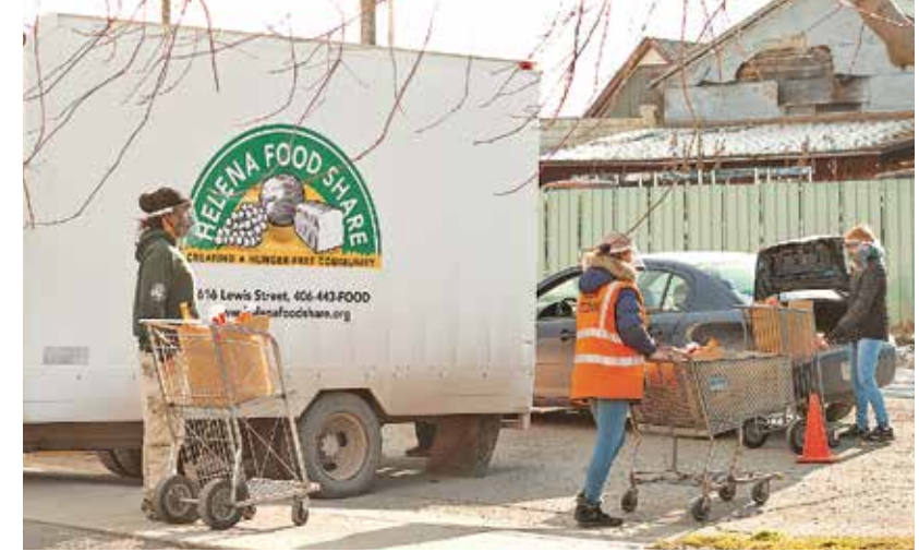
Curbside pick-up was incorporated for holiday meal distribution.