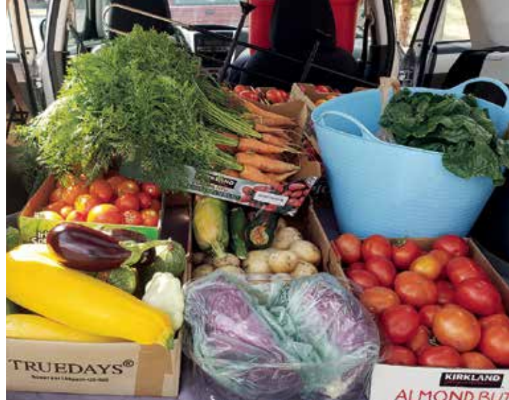
A load of produce from the Jubilee Garden heading to Helena Food Share. In total, the garden donated 3,600 lbs. of food to Helena Food Share last year.