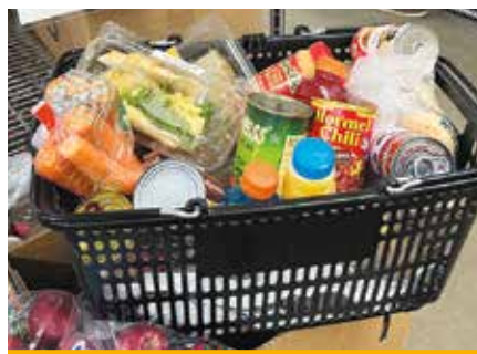
Basket shops make it easier for customers without homes and kitchens to pick up and store food.

As the number of customers reporting they no longer have a home has grown, Helena Food Share has added shopping options to assist these customers in managing food. If they don't have a place to store food, shoppers can come twice a week for a basket shop. This option lets