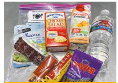
Emergency Food Packs contain high-calorie, easy-to-eat food.

food that is easy to open and doesn't require heating or further preparation, so ready-to-eat meals are essential items in the Pantry.